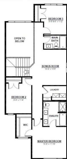
2ND FLOOR 1,084 SQ.FT (8 FT. CEILINGS)