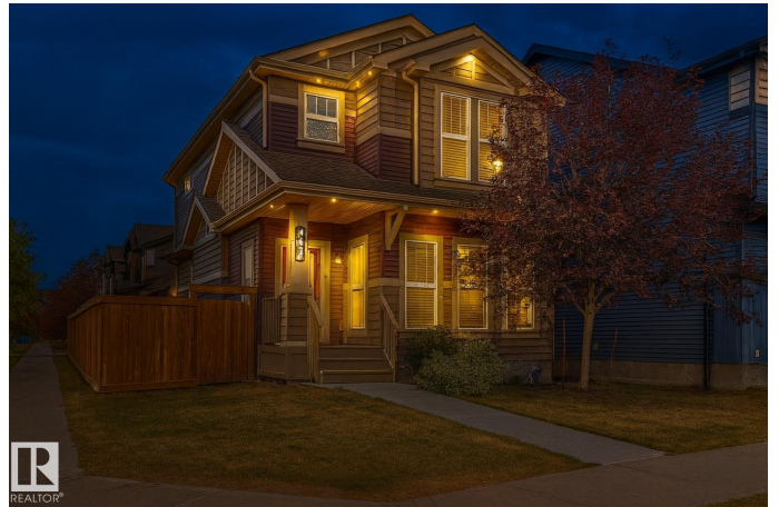
467 Orchards Boulevard Southwest, Edmonton AB T6X 1A2, CA