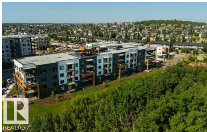
315-7471 May Common NW, Edmonton, AB