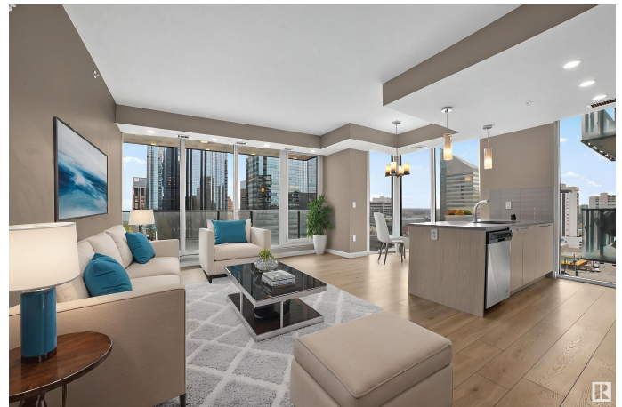
1404-10180 103 St NW, Edmonton, AB

Main Floor Exterior Area 940.08 sq ft Interior Area 868.60 sq ft