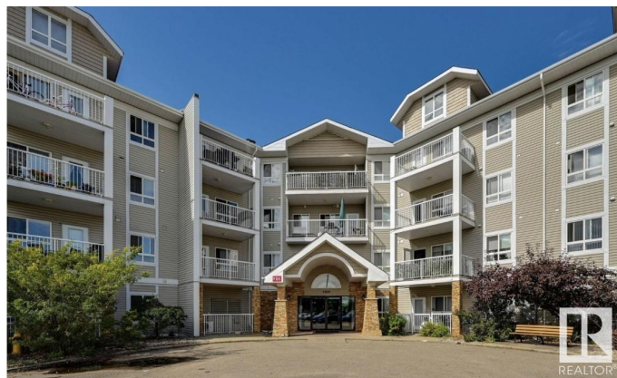
328-5350 199 St NW, Edmonton, AB